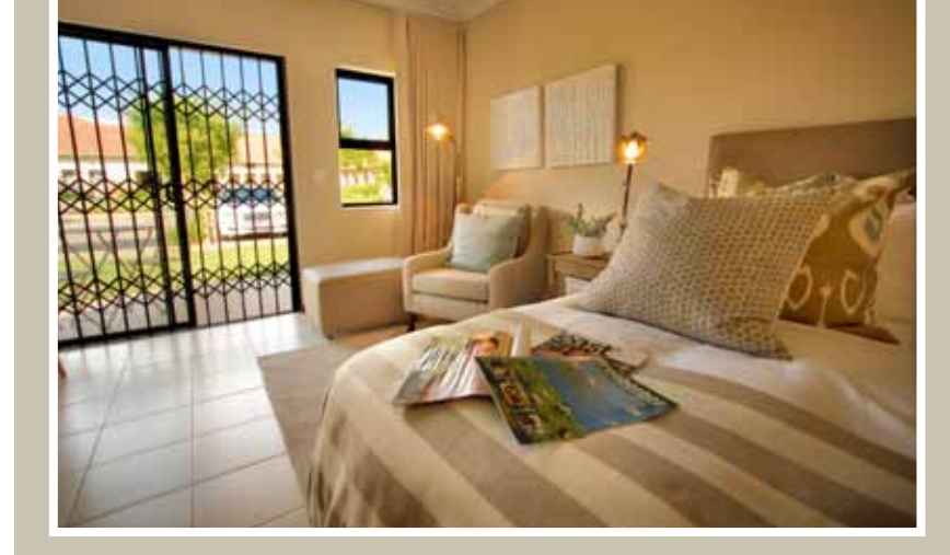
Above: An interior shot of the show unit at the Retreat Apartments.